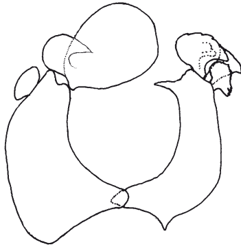
Figure 2. Pipizella certa , male genitalia lateral view. Hanliga genitalier av Pipizella certa sedda från sidan.

at base and confined to the basal half of the hypandrium. The specimen from Köpmanholmen was caught in a meadow along the seashore with Alnus glutinosus forest on the higher parts.