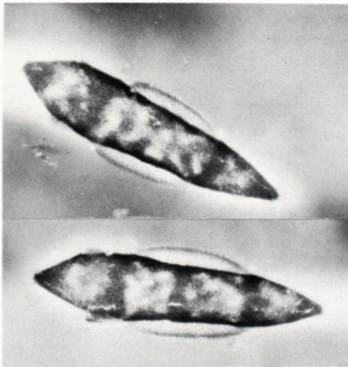
Fig. 1. An. (Ano.) messeae Falleroni. Eggs laid by females from Scania, Sövdeborg, Saxeröd 30.7.1975. Ratio of width to length 0.19. Magnification 35 \times.

An. (Ano.) messeae Falleroni. Ägg av honor från Skåne, Sövdeborg, Saxeröd 30.7.1975. Förhållandet mellan bredd och längd 0.19. Förstoring 35 \times .