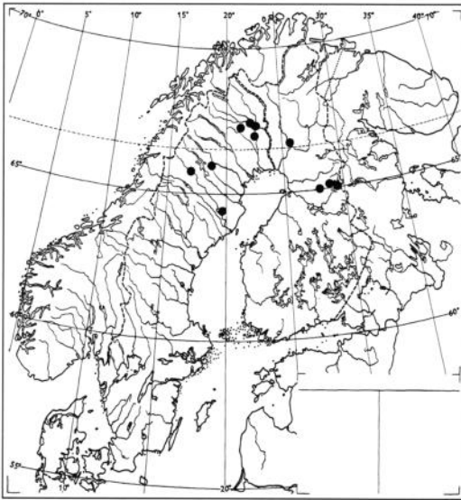
Fig. 13. Map of Fennoscandia showing known records of Heptagenia orbiticola Kluge.

Kända fyndlokaler för dagsländan Heptagenia orbiticola i Fennoskandien.