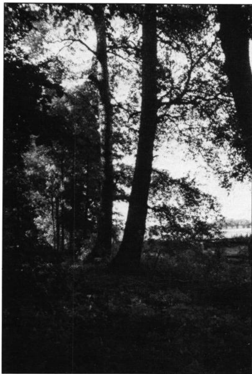
Fig. 2. The locality of Oligella nana at Scania, Vittskövle. It was found in putrifying organic matter in a dense growth of old poplar trees ( Populus sp.) on sandy ground.