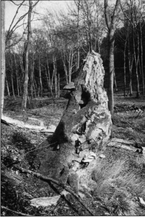
Fig. 3. A hollow beech stump ( Fagus sylvatica ). In southernmost Sweden a typical habitat for Ptenidium gressneri , P. turgidum , Ptinella aptera , and Pteryx suturalis . Found occasionally are Micridium halidaii , Ptenidium formicetorum and Ptilium modestum . Photo: M. Sörensson April 1988.

Ihålig bokstubbe vid Borstbäcksravinen i Skåne. Denna miljö är ofta rik på fjädervingar. Typiska arter i sydligaste Sverige är Ptenidium gressneri , P. turgidum , Ptinella aptera , och Pteryx suturalis . Ibland kan även Micridium halidaii , Ptenidium formicetorum och Ptilium modestum påträffas.