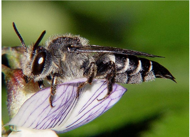
Figure 6. Coelioxys lanceolata Nylander ♀ (12 mm), a rarely seen parasitic bee species described from Småland and Västergötland. Its host is Megachile nigriventris Schenck. Photo by L.A. Nilsson.

Psithyrus svaveolens Wahlberg 1854: 209 Lectotype ♀ NHRS [examined]; SWEDEN, Östergötlands län, Östergötland; O.G./ P.Wg. [printed, P.F. Wahlberg]; Good, except fulvous coat on mid part of tergites 4-5 gone and tergite 3 largely hidden under tergite 2; Bombus quadricolor (Lepeletier) ssp. globosus (Eversmann), det. L.A. Nilsson 2006.