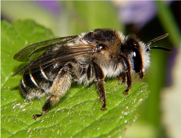
Figure 5. Melitta melanura (Nylander) ♀ on its type locality Gotland. The species is perhaps Europe's most critically endangered bee.