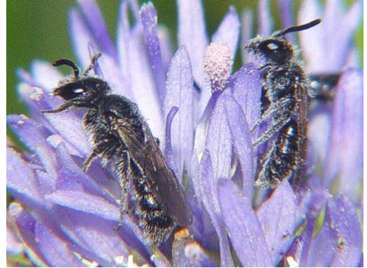
Figure 3. Dufourea halictula (Nylander) ♀ (left) and ♂ (4–5 mm), a bee species described from Degeberga in eastern Skåne. It is specialized on Jasione montana (Campanulaceae).

fors Spec. typ. No 5146 Andrena subopaca Nyl.". In addition, it bears a folded strip of paper with "Dies Ex. ist nach m. Meinung dies auf Seite 222 erwähnte Stück von Hellström." handwritten by J.D. Alfken. The ♂ specimen is here labelled as paralectotype. It bears also the labelling "H:fors"/ "d. 11/vii"/ "W. Nyland."/ "H-fors"/ "subop."/ "Mus. Zool. Helsinki Loan No. HY 2006 1951". The typification provides authentic material.