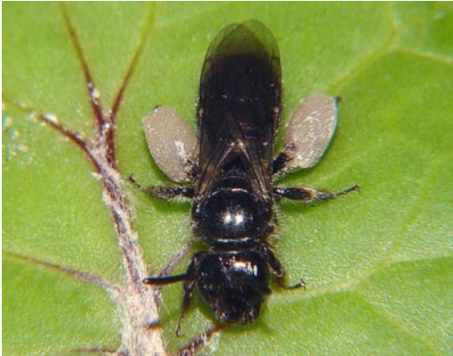
Figure 2. Panurginus romani Aurivillius, a taiga bee species described from Hälsingland. This ♀ (8 mm), on a Tussilago leaf a few seconds before she enters her nest, carries a characteristic load of mixed nectar and pollen of the main food-plant raspberry Rubus idaeus (Rosaceae).