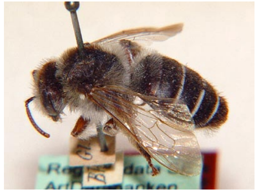
Figure 4. Kirbya melanura Nylander 1852a: 101, lectotype (NHRS) (12.5 mm). The specimen is a well-preserved ♀ collected in Gotland 1848 or 1849 by Carl Henrik Boheman.

The taxon was described from both sexes “in Scania cepit Cel. Boheman”. In Coll. Nylander (ZMH) there is no such Swedish material (L. Norén pers. comm. 2003). It has been assumed that authentic material is no longer in existence (Ebmer 1976: 4). However, Boheman (1853: 187–188) communicated exemplarily his capture of the type specimens at Degeberga in eastern Skåne 6–11 July 1851 and that these bees had been described by “Dom. W. Nylander”. In the same paper Boheman also provided a species description which is more detailed than Nylander's (but of course formally redundant). In Coll. Boheman (NHRS) there stand 2 ♀♀ of which one is labelled “ Sc. or. ” (= Scania orientalis = eastern Skåne) and “ Bhn. ” (= C.H. Boheman). The ♀ is syntype material and here designated as lectotype and labelled so. It also bears the label “Reg beedata SE ArtDatabanken 12958”. The lectotype conforms with the current interpretation of the species Dufourea halictula (Nylander) (as in e.g. Baker 1994, Amiet & al. 1999, Ebmer 1999). Apparently, earlier attempts to obtain any authentic material for the fixation of this taxon have been unsuccessful (cf. Ebmer 1984: 350, 1988: 681, 1999: 184). The typification provides recognition of authentic material and a specified type locality. The species (Fig. 3) is nationally redlisted as VU, vulnerable (Gärdenfors 2005).