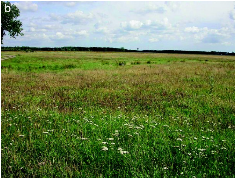
Figure 2. The habitat of M. tricincta at – a) Svarta håll 1 and – b) Kopparpsvägen with tank tracks and open grassland (purple patches= Odontites vulgaris ), respectively. Photo: I. Alves-dos-Santos 1.VIII. and 9.VIII.

Rödtoppebiets habitat vid – a) Svarta håll 1 och – b) Kopparpsvägen, med körspår efter tanks på sandmark invid videhåll respektive öppen gräsmark (purpurfärgade bestånd= rödtoppa).