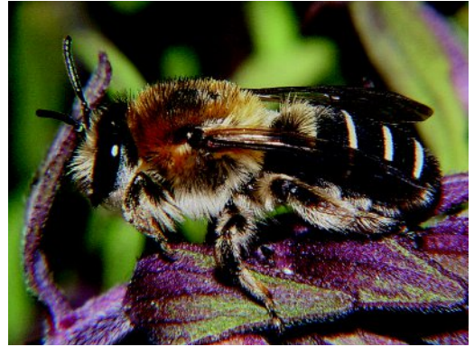
Figure 1. Melitta tricinta ♂ and ♀. Rödtoppebi ♂ och ♀.