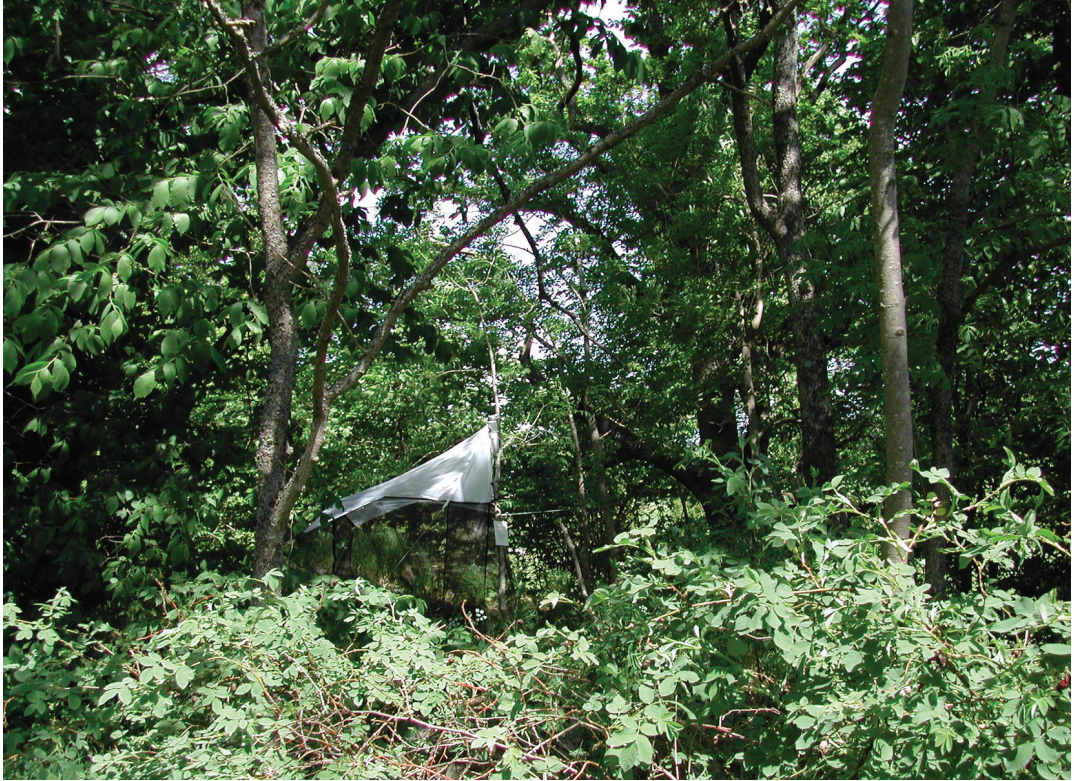
Figure 2. The habitat of Phytodietus (Weisia) januszi in Sweden; the single known Swedish specimen was caught by this Malaise trap.

Malaisefällan i vilken brokparasitstekeln Phytodietus (Weisia) januszi fångades för första gången i Sverige.