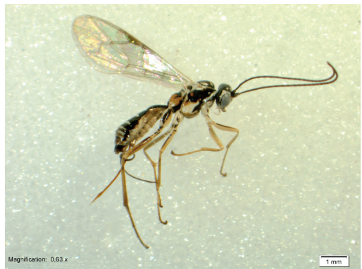
Figure 1. Phytodietus (Weisia) januszi , female from Sweden. Phytodietus (Weisia) januszi , en hona som är det första fyndet av denna parasitstekel i Sverige.

been recorded in Europe (Zwakhals 2013, Kasparyan & Shaw 2008), of which three belong to the subgenus Weisia Schmiedeknecht, 1907. The