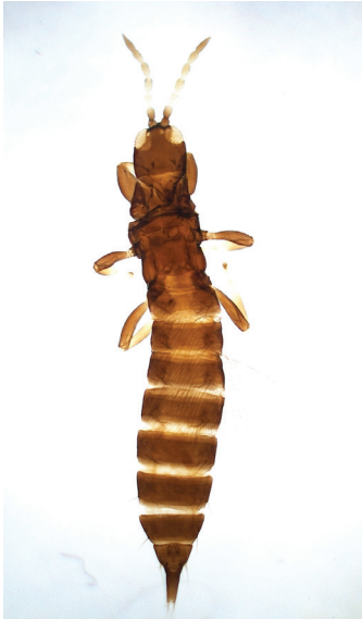
Figure 8. Haplothrips minutus . New to Sweden. Collected from two provinces, Sk. (Scania) and Sö. Probably living on dead twigs. Recorded from western and central Europe.

Ny art för Sverige. Insamlad i Skåne och Södermanland. Den lever förmodligen på döda grenar. Påträffad i Väst- och Centraleuropa.