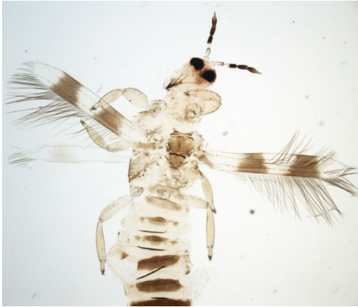
Figure 2. Aeolothrips gloriosus . The species is new to Scandinavia. It was collected in Sk. (Scania), Sandhammaren on Calluna . The species is known from Mediterranean area between the Azores and Turkey. Also recorded from Britain.

Arten är ny för Skandinavien. Den påträffades i Skåne, Sandhammaren, på ljung ( Calluna ). Utbredningen är känd från Medelhavsområdet mellan Azorerna och Turkiet. Den är även insamlad i England.