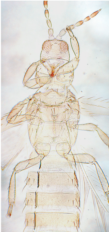
Figure 5. Thrips brevicornis . New to Sweden. Recently found on Öland, Ismantorp, 2014. A common species in Europe on many flowering plants.

Ny art för landet. Nyligen, 2014, insamlad på Öland, Ismantorp. Arten är vanlig i Europa. Den lever på många blommande växter.