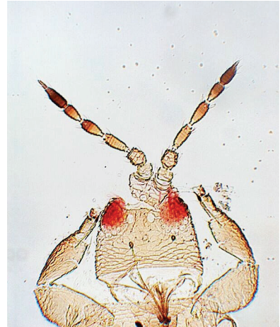
Figure 3. Dictyothrips betae . New to Sweden. An old finding from Sk (Scania), Höör, 1943 on Polygonum (Fallopia) convolvulus . Recorded from Denmark, Finland and many European countries.

31. rufus Haliday 1836 – SE: Sk, Ha, Sm, Öl, Bo, Sö, Up, Dr, Nb; – NO; DK; SF; IC.