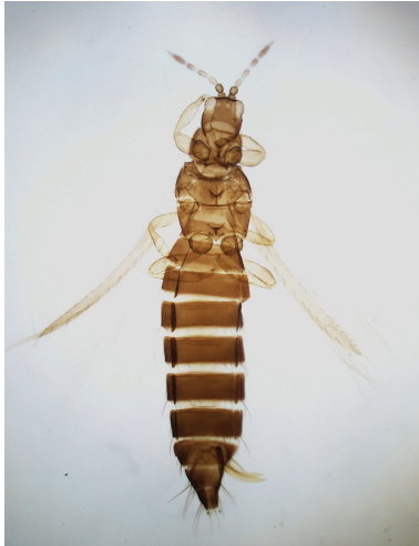
Figure 6. Thrips fulvipes . New to Sweden. An old finding from Sk. (Scania), Fogdaröd, 1943 on Mercurialis perennis . Widespread in Europe.

Ny art för Sverige. Ett gammalt fynd från Skåne, Fogdaröd, 1943, på skogsbingel, Mercurialis perennis . Vanlig i Europa.