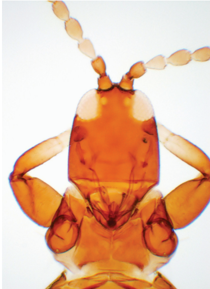
Figure 9. Haplothrips senecionis . New to Sweden. Recently, 2014, collected from Öland, Gårdby sandhed. Lives on Senecio jacobaea . Rare in Norway. In Europe only from Britain, France and Holland.

Ny art för Sverige. Nyligen, 2014, insamlad på Öland, Gårdby sandhed. Lever i blommor av stånds, Senecio jacobaea . Enligt Norska uppgifter är den sällsynt. Arten är endast känd från England, Frankrike och Holland.