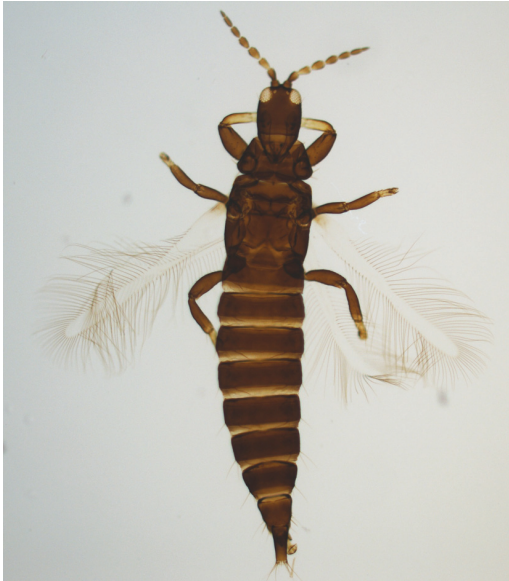
Figure 11. Hoplothrips semicaecus . New to Sweden. Collected in Sk. (Scania), Borgeby, 1944, under bark of Cytisus and Uppland, Uppsala, 1986. Widespread in Europe on dead wood.

Ny art för Sverige. Insamlad i Skåne, Borgeby, 1944, under bark av harris ( Cytisus ) och i Uppland, Uppsala, Stadsskogen, 1986. Allmän utbredning i Europa på död ved.