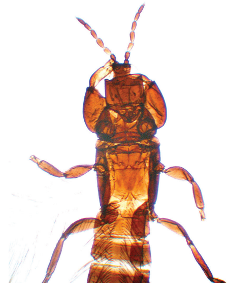
Figure 10. Haplothrips utae . New to Sweden. Only find from Småland, 1973, on Arrhenatherum elatius . Collected in Norway on Aster tripolium and Juncus . Recorded only from Germany and Hungary.

Ny art för Sverige. Nyligen, 2014, insamlad på Öland, Gårdby sandhed. Lever i blommor av stånds, Senecio jacobaea . Enligt Norska uppgifter är den sällsynt. Arten är endast känd från England, Frankrike och Holland.