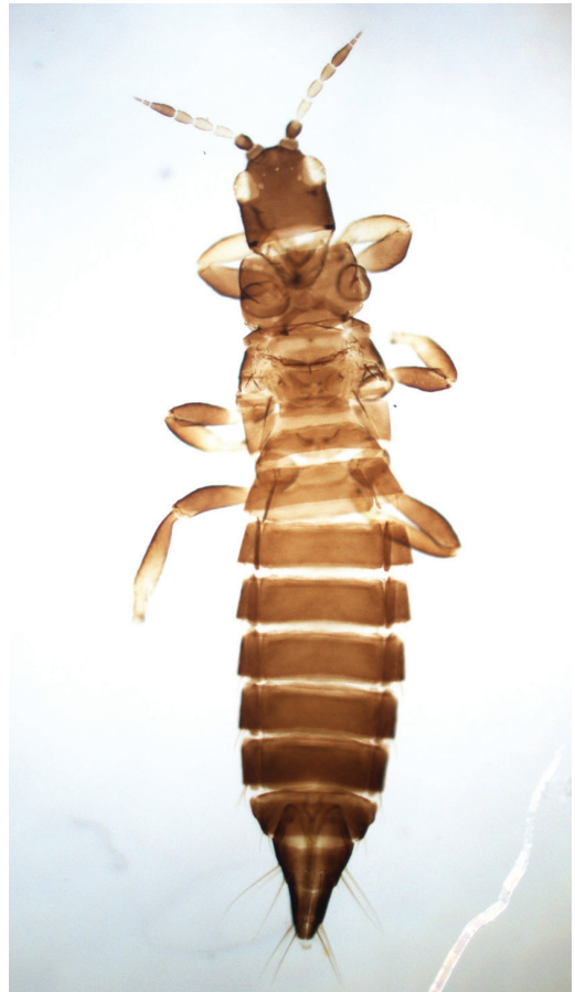
Figure 4. Iridothrips iridis . Only collected in Sk. (Scania) on Iris pseudacorus .

Endast fynd från Skåne på svärdslija ( Iris pseudacorus ).