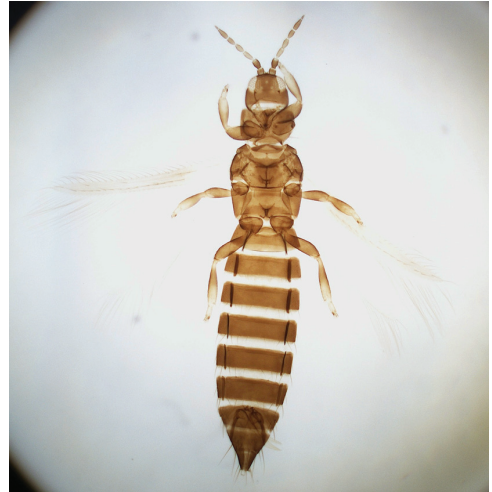
Figure 7. Thrips menyanthidis . New to Sweden. One find from Sweden in Dalarna, Orsa, 1983, on Menyanthes trifoliata . In many European countries.

Ny art för Sverige. Ett gammalt fynd från Skåne, Fogdaröd, 1943, på skogsbingel, Mercurialis perennis . Vanlig i Europa.