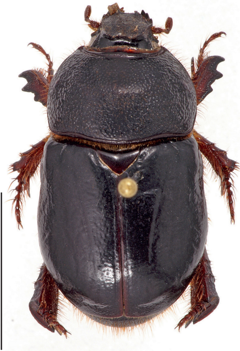
Figure 1. Temnorhynchus baal , an exotic dynastine collected at a disused sawmill in Hölö, Södertälje in 1988, clearly different from the common Oryctes nasicornis that could be expected at such a site. Scale bar = 10 mm.

Temnorhynchus baal , en exotisk noshornsbagge som hittades vid en nedlagd såg i Hölö, Södertälje 1988. Detta var något annat än den vanliga Oryctes nasicornis som man kunde vänta sig på en sådan lokal. Skalstrecket är ca 10 mm.